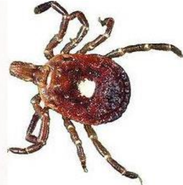
Lonestar Tick