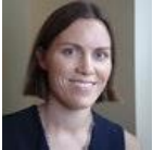
Emily Oster Economics Professor, Brown University https://parentdata.org/

That's it, this is just a post about ticks.